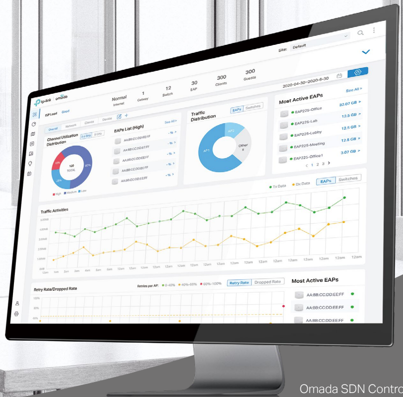
Omada SDN Controller